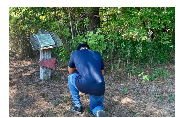
Honouring Rosa Park's special tree

"Iget lost even with Google maps, but -Blessing