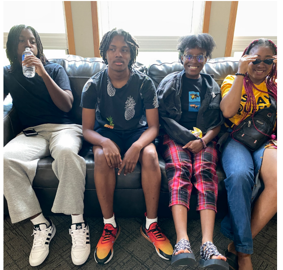
How many can we fit on one couch?