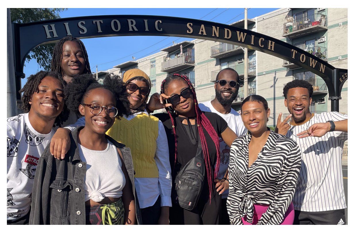
The Historic Sandwich Town Arch

Our jam packed day starts at the Amherstburg Freedom Museum with a tour. Taking us back to day one, we hear about the role church played for freedom seekers. Some churchs were not only built by freedom seekers, but they had false floors, creating a hiding space for when the bounty hunters came seeking to bring escaped slaves back to their "owners". Next, we meet with Lana Talbot, who gives us a walking tour of historically Black Windsor neighbourhoods. During our walk, we're acosted by security, who asks