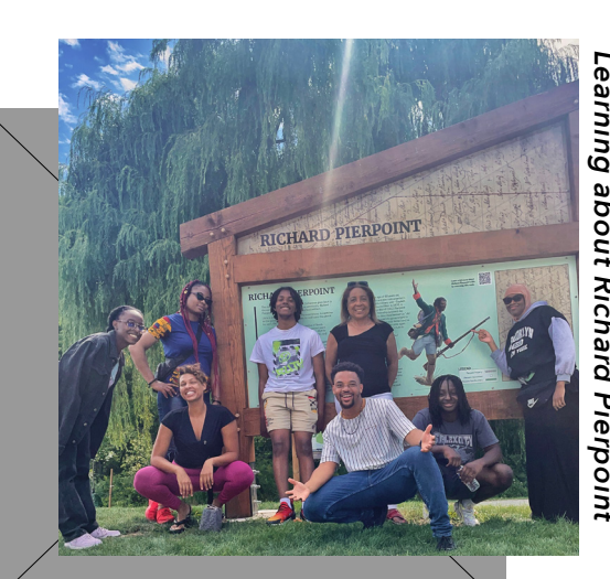
Group pic at Freedom Park

as well as so much empathy and understanding for those who came before me.